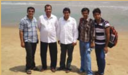
Participants at Sightseeing and Dance party