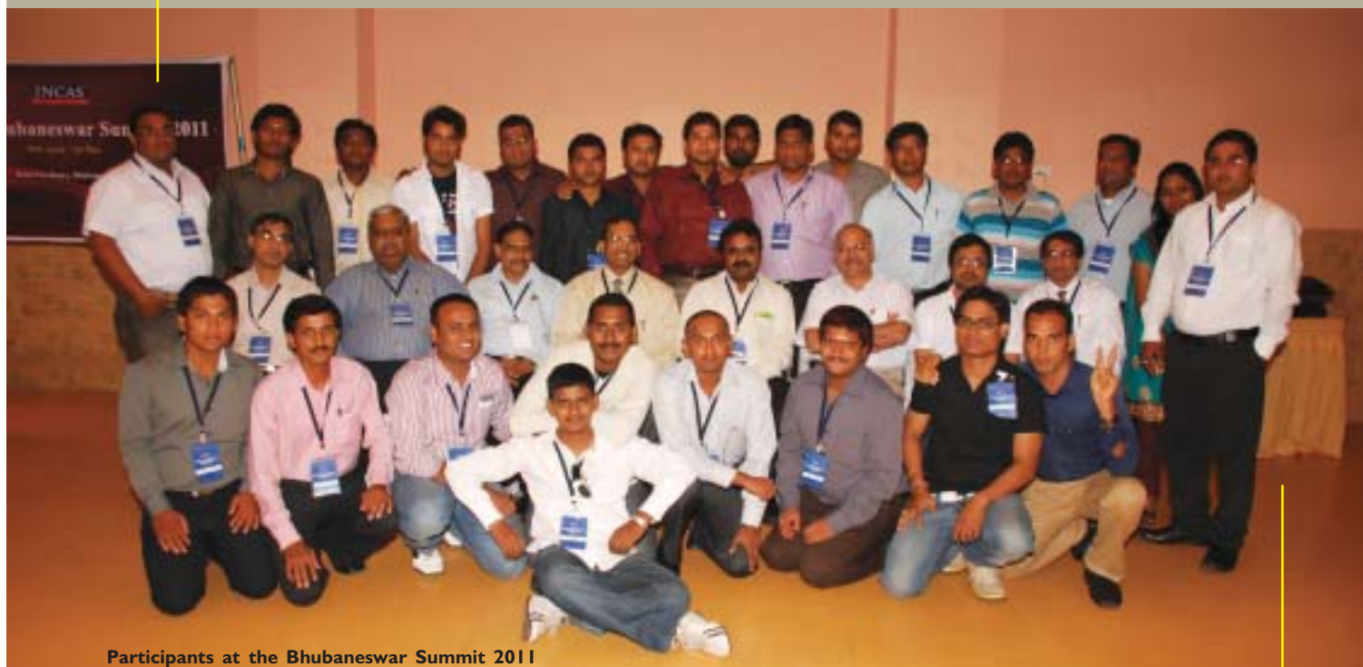
Participants at the Bhubaneswar Summit 2011

I NCAS Bhubaneswar Summit 2011 a conference of the Chapter Executive Committee members of the East Zone at The Presidency Hotel, Bhubaneswar. 35 CEC members participated in the summit. The participating chapters were Cuttack, Vizag, Berhampur, Bhubaneswar, and Kolkata.