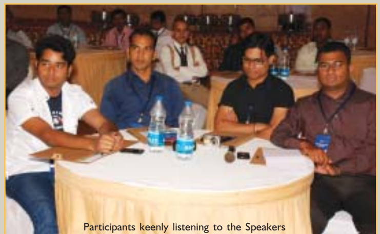
Participants keenly listening to the Speakers