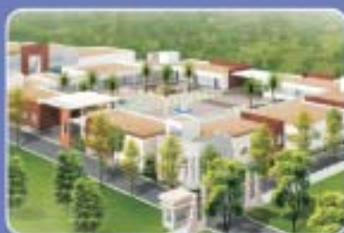
Dewas, Madhya Pradesh

The ICFAI University Group consists of statutory universities, a deemed university and institutions likely to be notified as Universities. Some campuses are operational and others are expected to be ready during 2011-12. Each University is governed by relevant legislation and regulations. © IUG 2011.