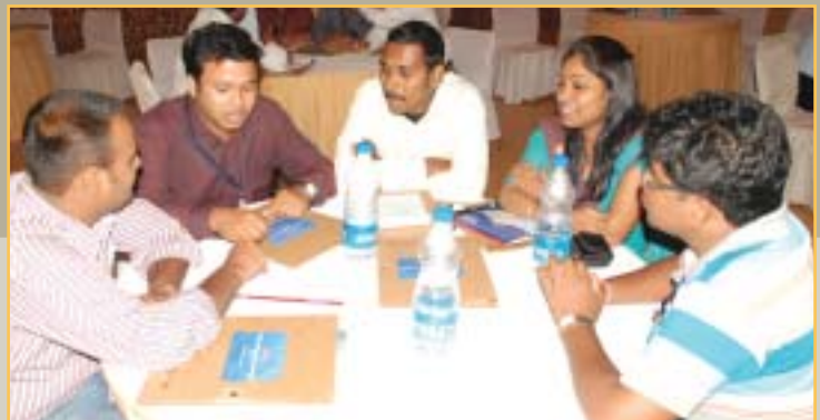
A Group Discussion at the Conference