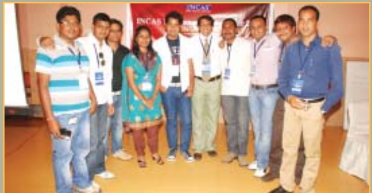
Participants at the Conference