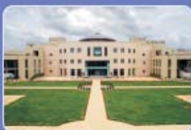
Hyderabad, Andhra Pradesh