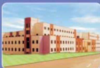
Baddi, Himachal Pradesh